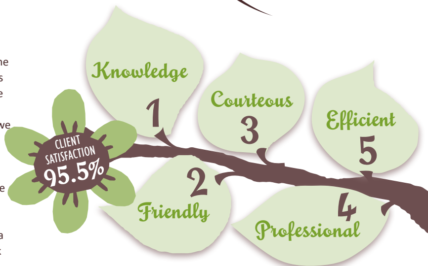
Based on our 2010 Customer Care Survey, the above graphic shows the top 5 reasons customers like working with NPHC along with our overall client satisfaction rating of 95.5%.