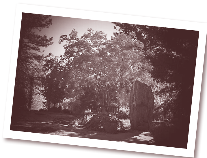
The right tree in the right place makes all the difference.

As opposed to non-living materials such as wood, metal, brick or stone, plants are living elements of the garden that provide dynamic change with the passing of the seasons and over the broader span of time. Individual plant choices and arrangements must satisfy functional qualities, as well as fulfill aesthetic design intent. Is there a need for a shade tree to shelter a patio in the summer, a sound barrier to muffle a road or hedge to screen an unsightly view? What are the maintenance expectations? Are you interested in a feature such as a pond or vegetable garden and which areas of the site would best lend itself to that purpose? Once functional needs are determined, establishing the detailed environmental aspects of the site or "culture" will help to focus and direct plant selection.